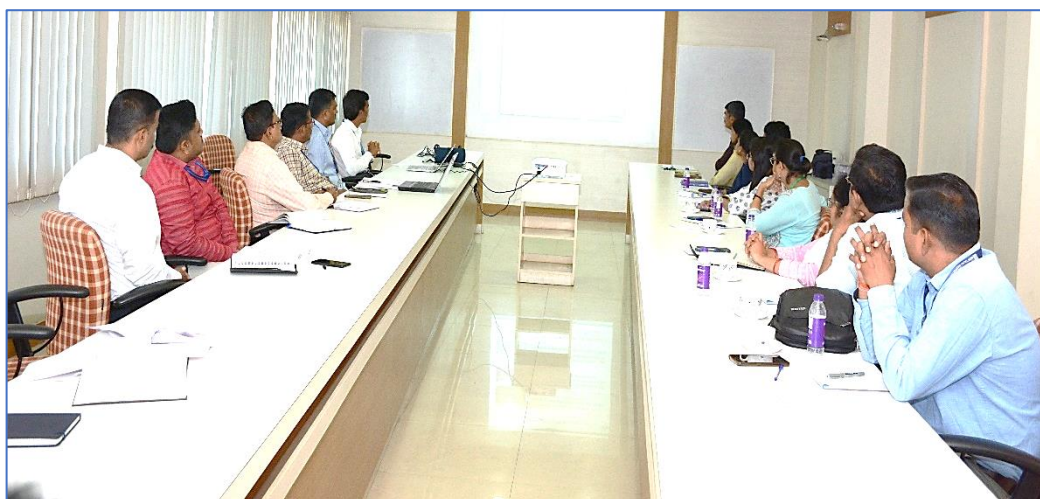
Figure 1. - Training program on Pollution control and Environment Management in Sugar Factories and Distilleries